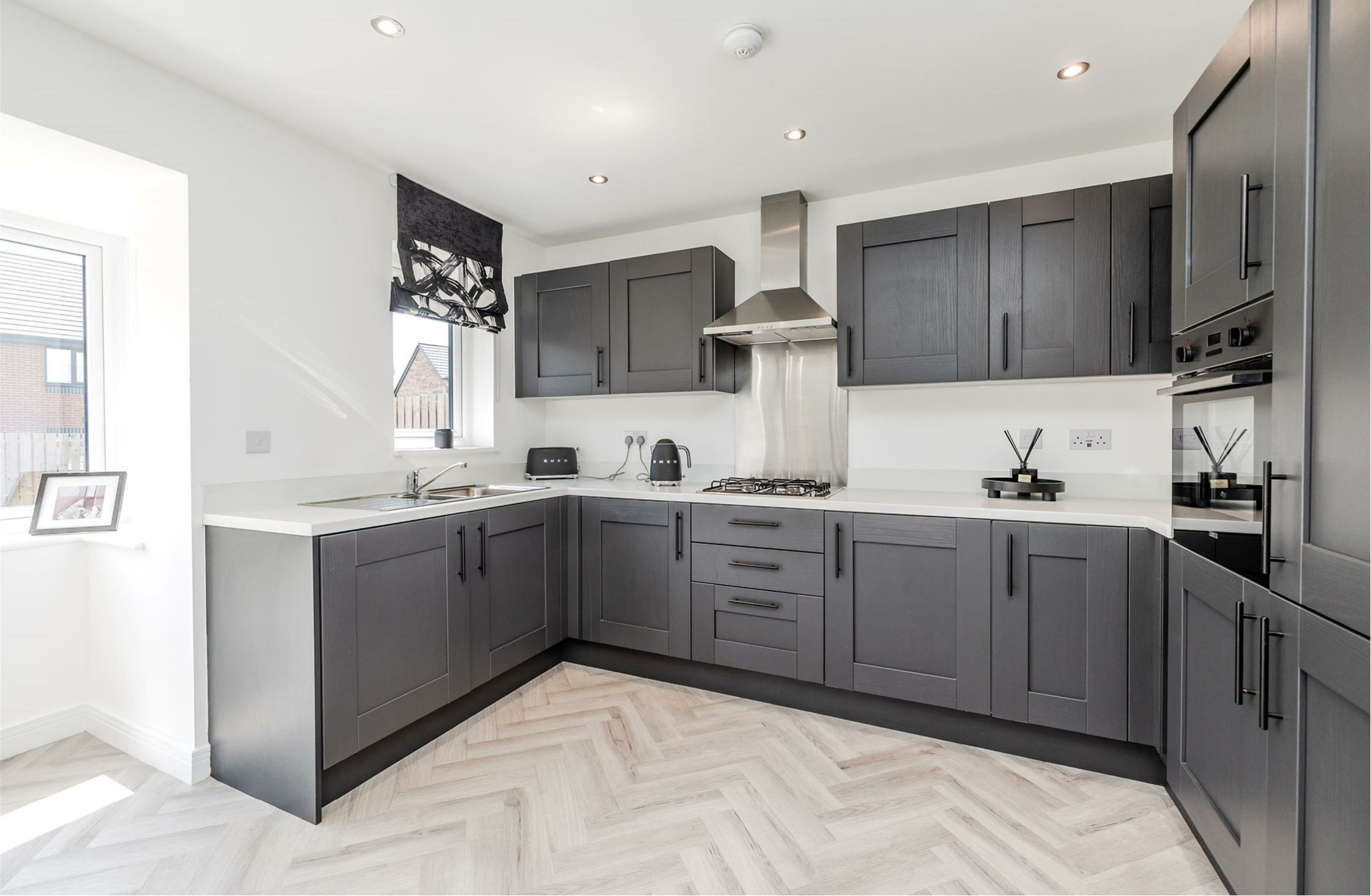
3 Rosella Drive, Abbey Heights, Newcastle Upon Tyne, NE15 9GU